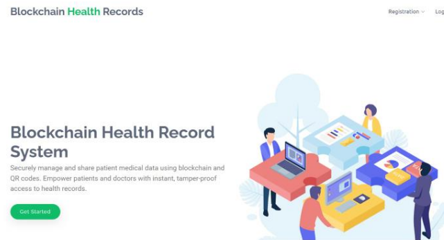
Fig: Home Page