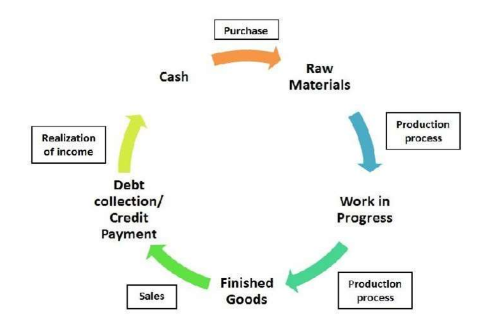
Operating Cycle of a Business

which alsodetermine the time gap between the start of the process and the ending of that particular process. For example, if the organisation is using capital intensive technique then the time period will be reduced in comparison to labour intensive technique, in most of the cases. And same is the case with the product, when small product is produced it will take less time period than in comparison to large and complex goods being produced. Thus, by this we can conclude that shorter the manufacturing cycle the lesser the working capital will be required by the organisation.