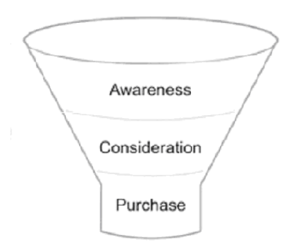
Figure: Classic Purchase Funnel (Evan 2008).

Consideration links the buying process activities by connecting awareness and purchase, thus all considered factors, such as brand reputation, applicability, performance, and so on, trigger a potential purchase. In comparison to traditional media, since social media connects with and involves consumers from awareness all the way through consideration in which simultaneously tackles awareness and consideration instead of inciting a purchase from the awareness perspective.