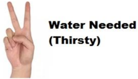
Fig. 5. Gesture and Corresponding Output.