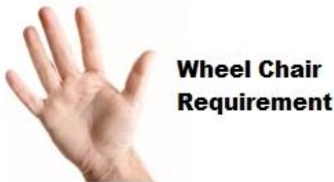
Fig. 4. Gesture and Corresponding Output.