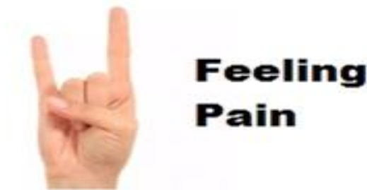
Fig. 3. Gesture and Corresponding Output.